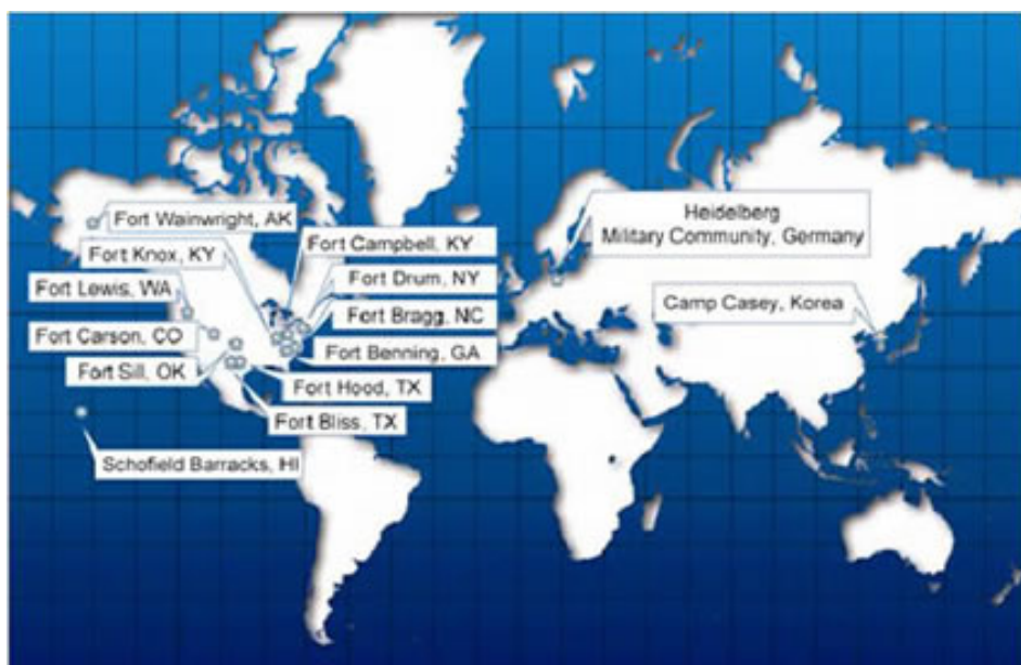
Current eArmyU Enrollment Sites - Updated July 2003

Colleges and universities must adhere to specific requirements in order to participate in eArmyU. Institutions offering undergraduate certificates, associate degrees, or bachelor's degrees must be members of the Servicemembers Opportunity Colleges Army Degree (SOCAD) program. Institutions offering graduate-level degrees and graduate certificates must be members of Servicemembers Opportunity Colleges (SOC). SOCAD ensures guaranteed transferability of credit among SOCAD institutions, as well as maximum award of credit for prior learning and military experience.